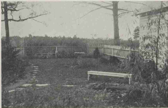
The garden of a 4-H Club member.