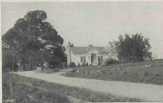
An attractive rural home.