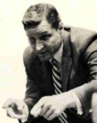
Norman Sloan 1970 ACC Coach of Year