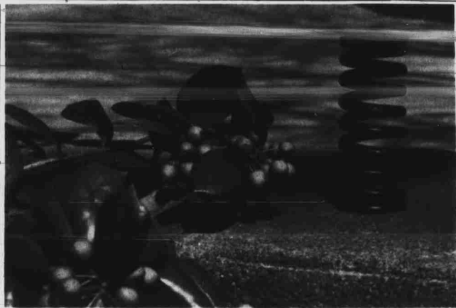
THE FIRST SIGN OF SPRING

As of next September, ROTC will be compulsory again. This announcement was made by Maj. Gen. Anhauser B. Schlitz and Maj. Gen. Limp Belly in a joint press conference with The Technician last night. The ROTC commanders emphasized the fact that the