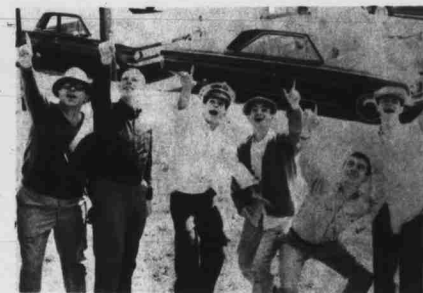
In a preview performance at Broughton High School yesterday, six members of Cryout UFO demonstrated Sighting Techniques.