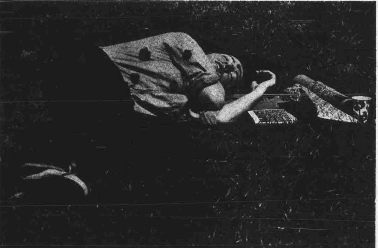
The latest victim of the fence controversy, pictures seconds after being fatally shot Saturday.