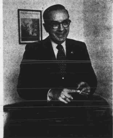
Senator Jesse Helms will make a guest appearance as the Pin Ball Wizard in the Smithfield Community Opera's EOTC production of "Tommy."