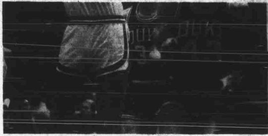
All that remained was headless Devils.

were playing against just robot-like things." The student went on to explain that Foster had been right in his guess and the Blue Devils did indeed lose the national championship to Michigan State at Cameron Indoor Stadium. Nonetheless, the explosion that wiped out the team remained a mystery to the student. The police did reveal the fact that a tape recorder had been found among the remnants left from the explosion. "Even though we lost I still am sure that we are the best team in the nation," the recording said, believed by voice experts to be the voice of Mike Gminski, the Duke center. "Magic Johnson is a fair ballplayer, but I'd still say Kenny (Dennard) is better," the voice continued. "I don't think the fact that Earvin scored 46 points and Kenny scored four means Johnson is any better. "I mean look at the other stats. Kenny got six rebounds and Johnson got 12. Kenny had three assists and Johnson had 11. Obviously, Kenny is the better