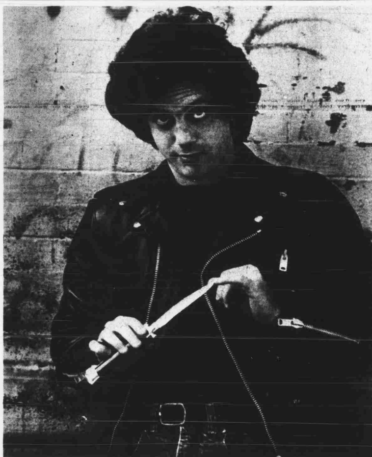
After Saturday night's concert in Reynolds Coliseum, Billy Joel casually poses with the exact same knife he used to polish off Paul McCartney.

Accompanied by two bodyguards, Joel and his band rushed to his bus only to discover that it had been towed by Security, and was now resting peacefully at Medlin Gulf.