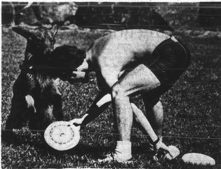
Doggie Death was the scene Sunday when this carnivorous canine attacked an innocent frisbee-ist in the Student Center Plaza. For the gruesome details, read the accompanying story. If you dare.