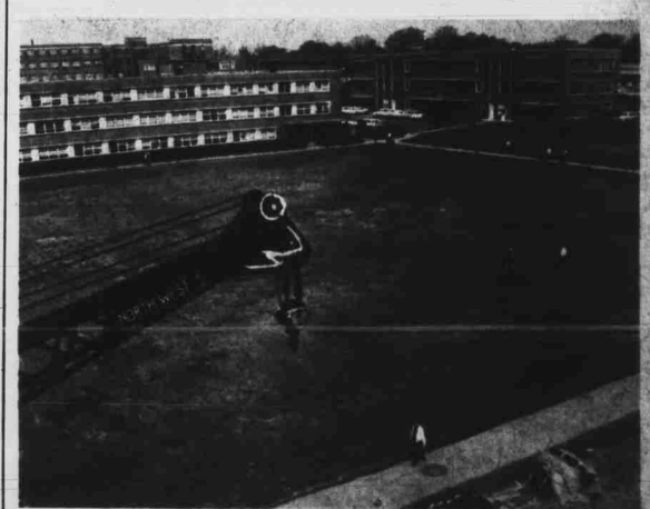
A moment of panic engulfed North Carolina State College this week when a passerby spied what he thought to be the monster Gorgo (star of the motion picture by the same name) ready to devour Hareison Hall now under construction on the college campus. Just before sending off a chain reaction of terror across the campus, the onlooker realized the dreaded monster was merely a harmless crane dolled up with war paint. The "beautiful" piece of construction equipment was apparently the product of a light-hearted prankster.