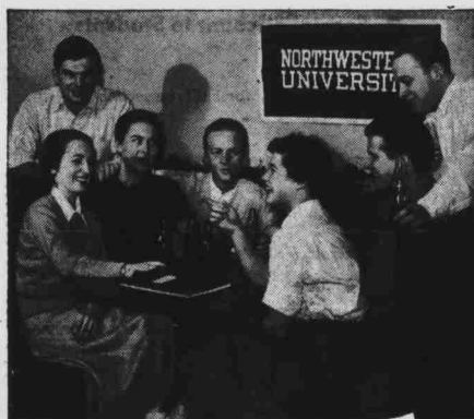
The Grill, Scott Hall Northwestern University Evanston & Chicago, Ill.