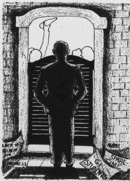
ATTENTION SOCIAL FUNCTIONS COMMITTEE!!

In addition to all the other articles which have been sent "up", THE TECHNICIAN adds its plea for a barber shop with reasonable prices to be located at a convenient