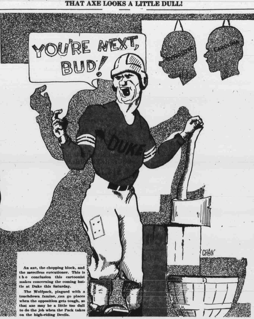
An axe, the chopping block, and the merciless executioner. This is the conclusion this cartoonist makes concerning the coming battle at Duke this Saturday.

five days after playing Duke, and nine days later closes the season against The Citadel. The Carnegie Tech game will be played here as the feature attraction of Thanksgiving Day, while The Citadel game will be played in Wilmington.