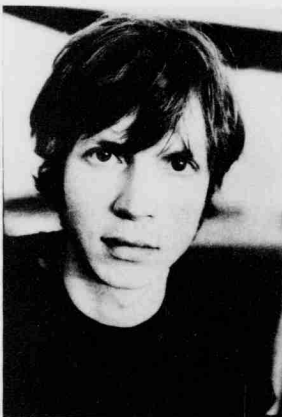
Beck was one of many live acts at NCSU.

■ It was a good year for music at N.C. State.