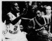
Technician File Photo