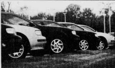
Used cars you can afford.