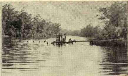
(Above) Swimming in Lake Lasseter