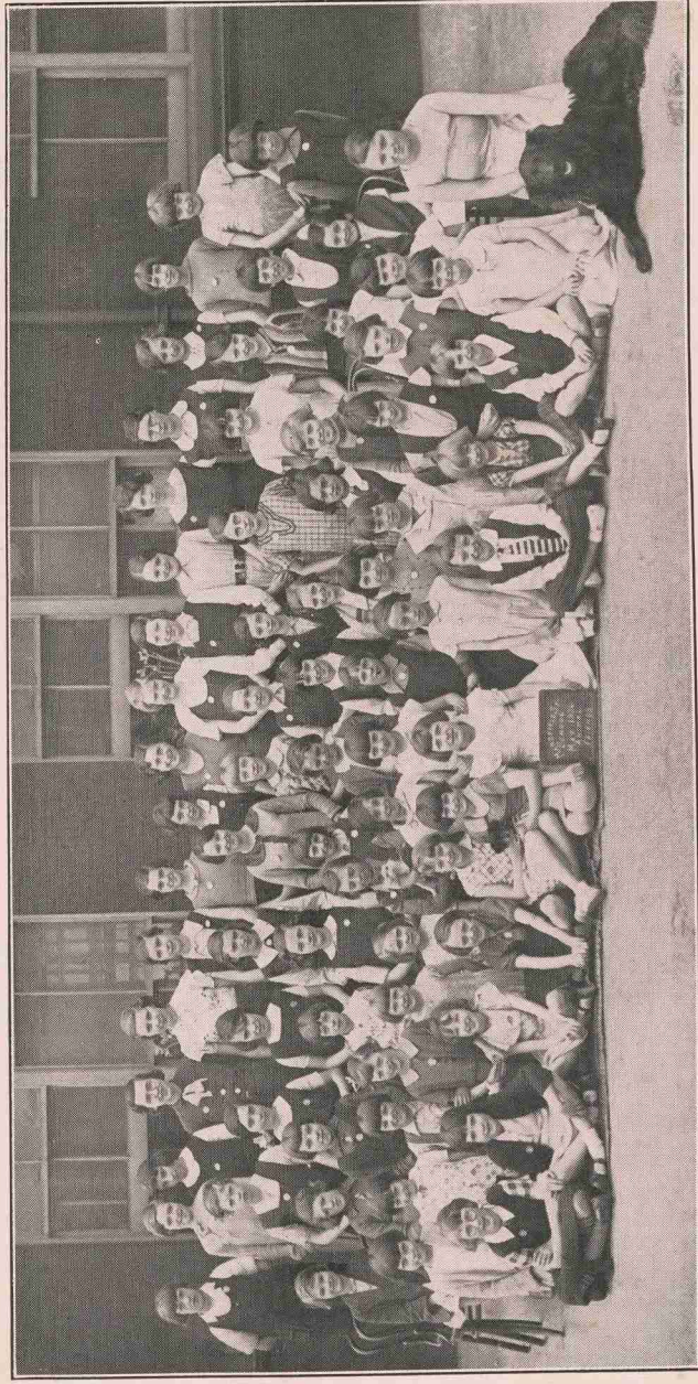
One of the many groups of school children associated with the Humane Education Society in the Movement for Kindness, Peace and Goodwill

Parents, Teachers, Children, and all who are interested in Welfare Work are invited to join the Society PLEASE WRITE OR CALL FOR LITERATURE AND INFORMATION