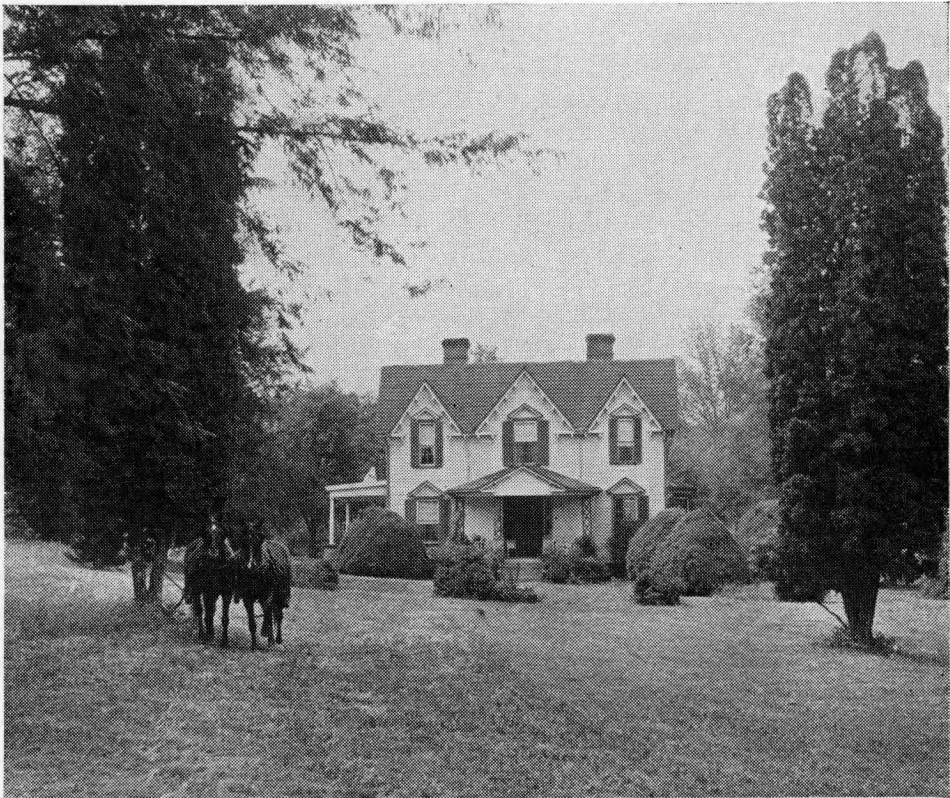
A HOUSE THAT COULD BE CALLED HOME.