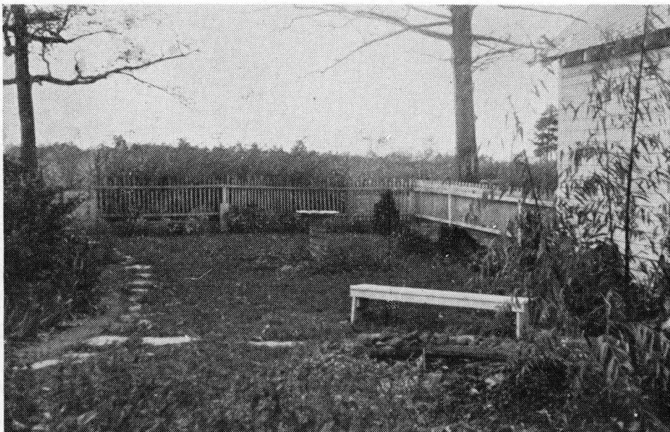
The garden of a 4-H Club member.