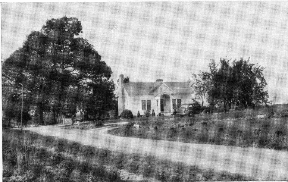
An attractive rural home.