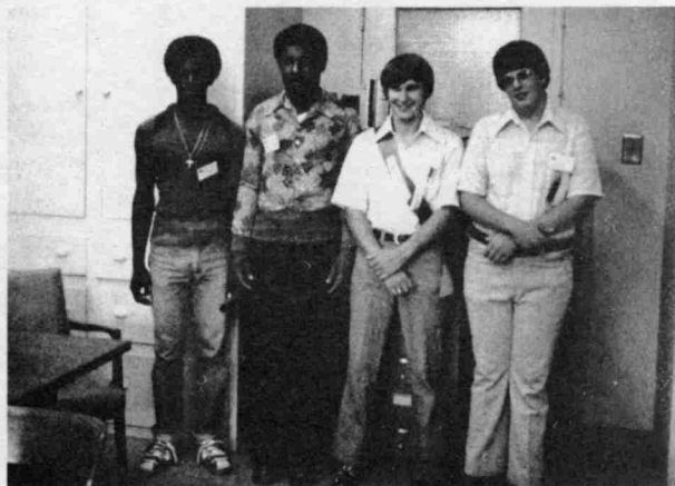
Boys' Dress Revue Finalists