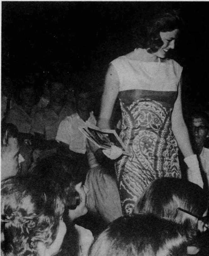
Marilyn Van Debur walks to the podium.