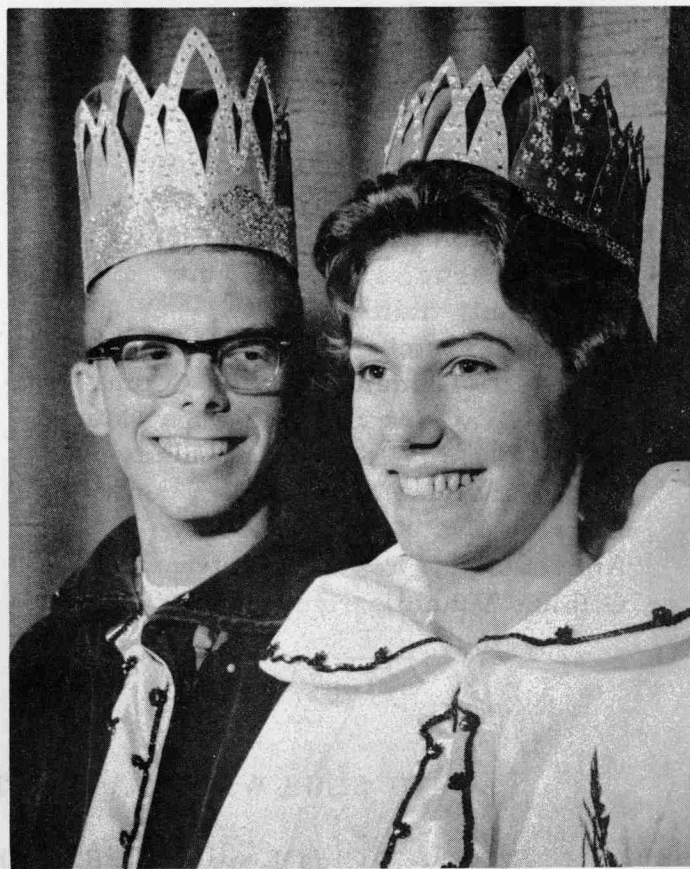
KING AND QUEEN OF HEALTH

(Roger Sharpe) "LEARN, LIVE, SERVE, THROUGH 4-H"