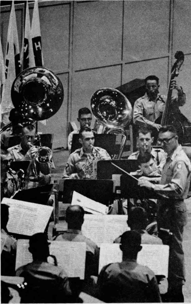
82 nd Airborne Band