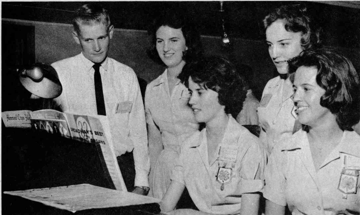
Organ Melodies and Fellowship