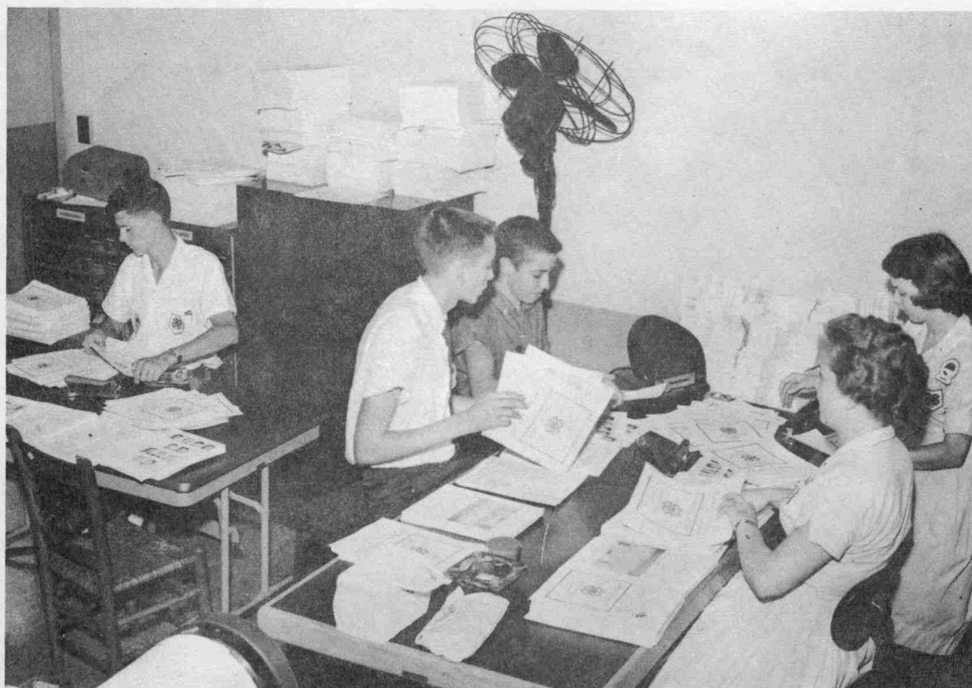
ISSUING THE NEWS —Twelve selected 4-H'ers worked hard this week getting this daily newspaper to you. The circulation staff is shown above assembling a day's issue.